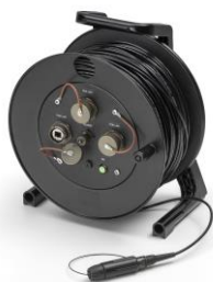
SINUS Fiber optic client with battery