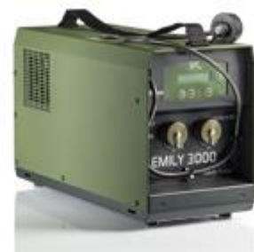
Ethanol Fuel cell for Fiber optic client