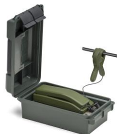
SINUS Inductive coupled mobile telephone (ICMT)